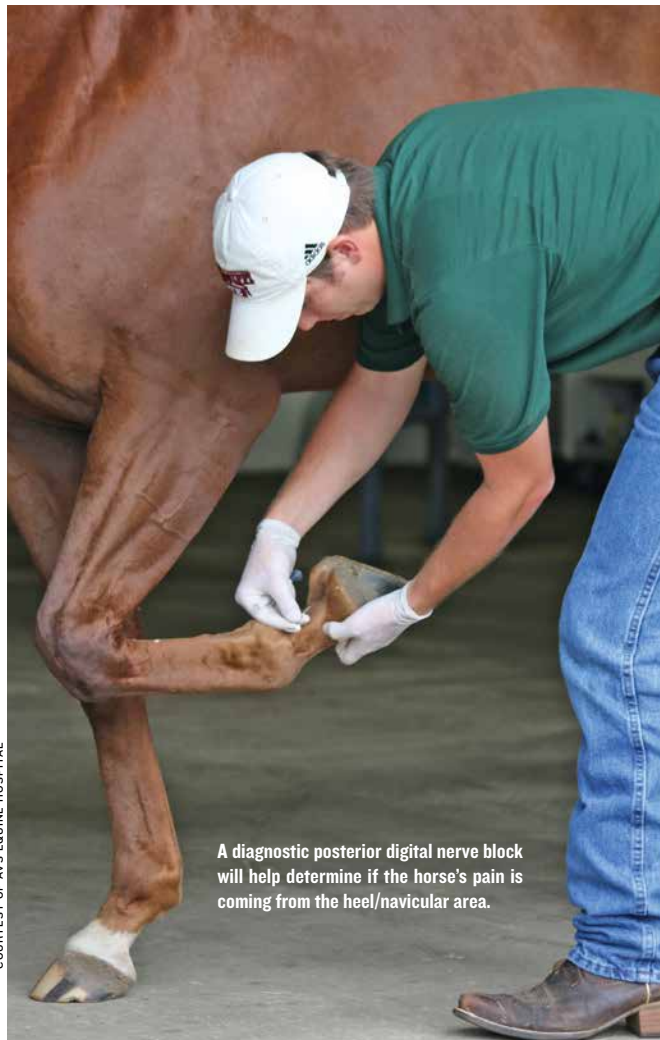
A diagnostic posterior digital nerve block will help determine if the horse's pain is coming from the heel/navicular area.

There are numerous options for the treatment of navicular syndrome, with newer therapies being approved each year. The key to management of the navicular patient is balance. The hoof should be appropriately balanced when doing corrective shoeing. A balanced approach to pain management, rest and athletic performance should be considered. A balance of risk vs. reward should be considered when pursuing invasive treatments. The relationship between owner, veterinarian and farrier requires all parties to be on the same page and a balance of teamwork. This balance can yield a successful outcome with the navicular patient. ■