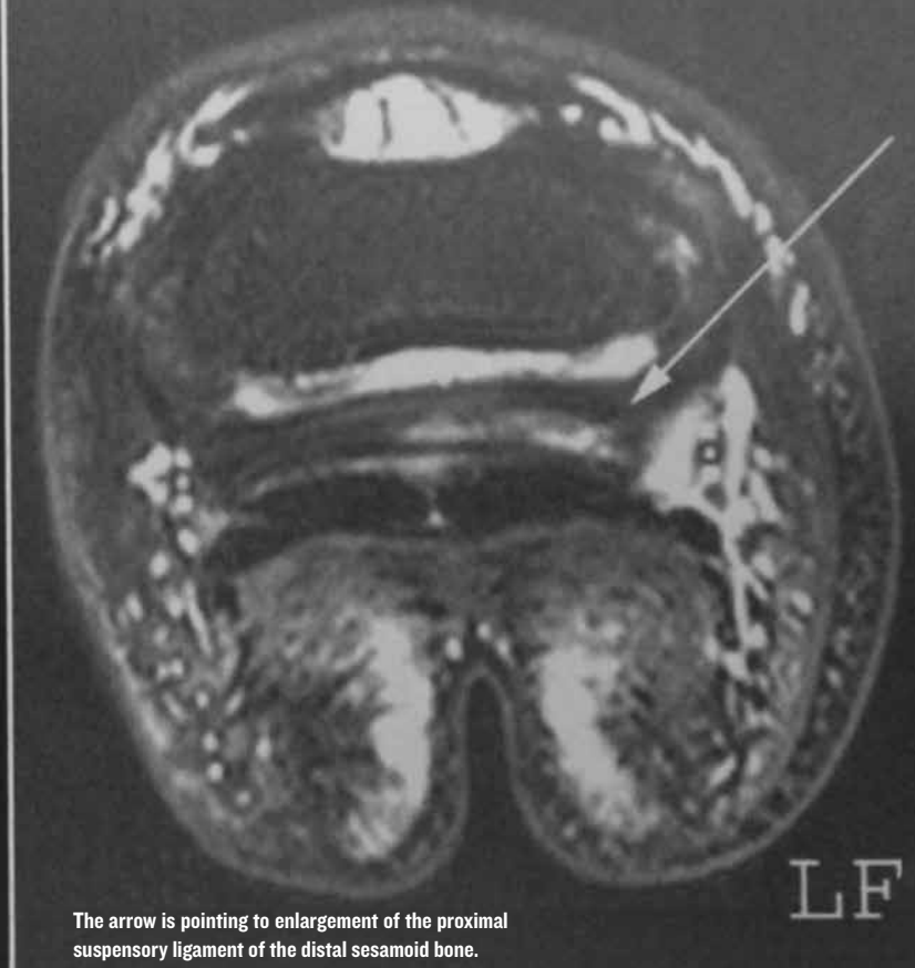
The arrow is pointing to enlargement of the proximal suspensory ligament of the distal sesamoid bone.